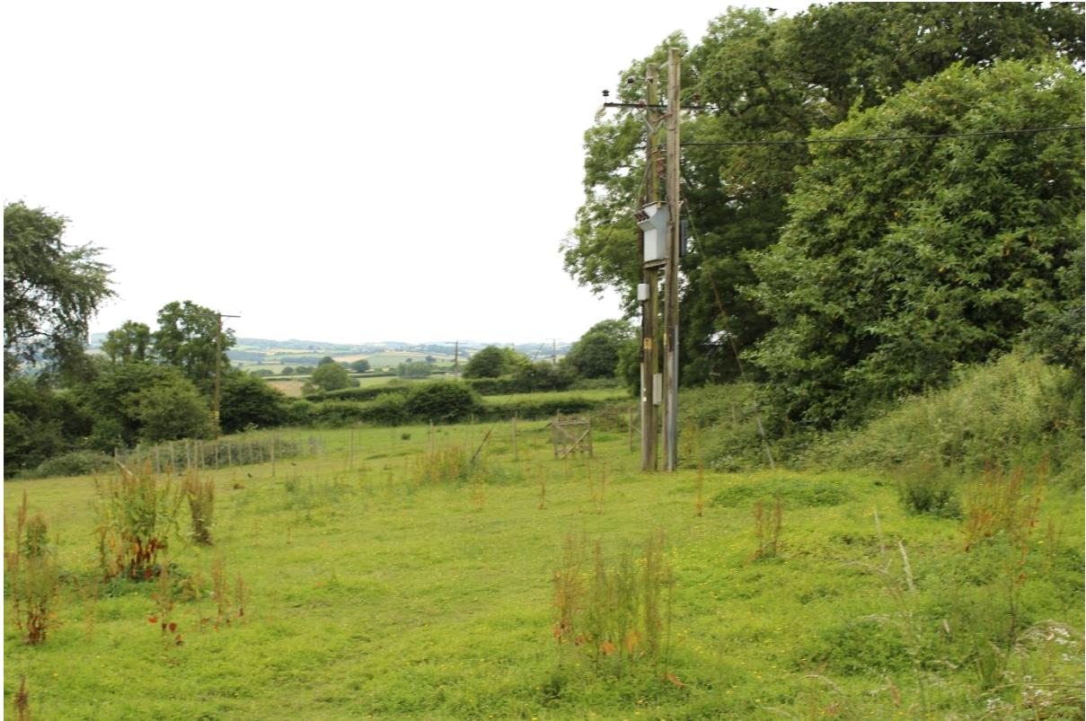
Image 5: Image as per location of Images 3 and 4 but looking westwards along the sites northern boundary.