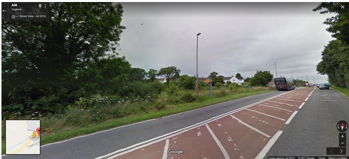
Image 8: From Google Streetview looking to the north-west, the site is visible behind the speed camera.