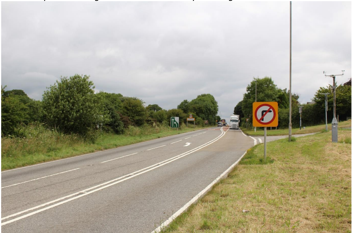
Image 2: Further image from the eastern side of the A30 looking northwards, the image was taken further to the south from Image 1.