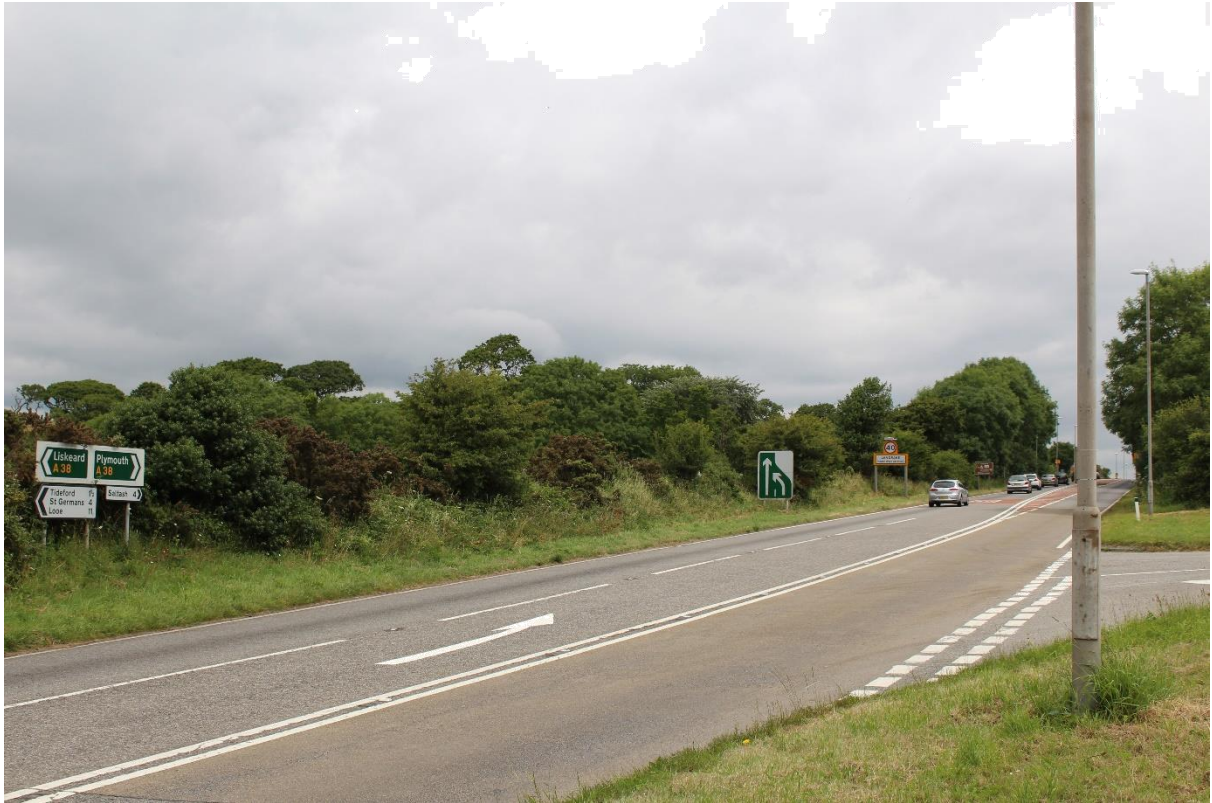
Image 1: Image from the eastern side of the A30 looking northwards, the site is centrally in the image behind the boundary coverage