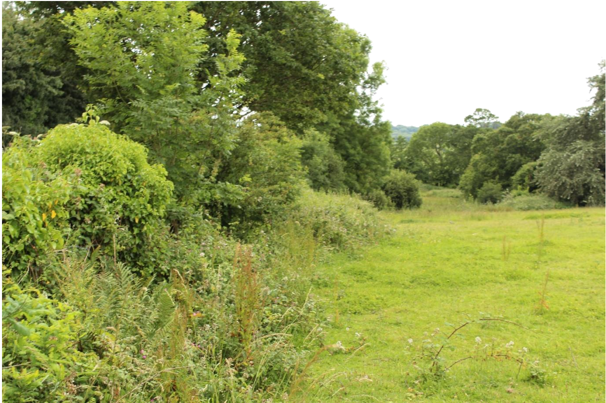
Image 3: Image from the north-eastern corner of the site looking southwards along the sites eastern boundary which adjoins the A38.