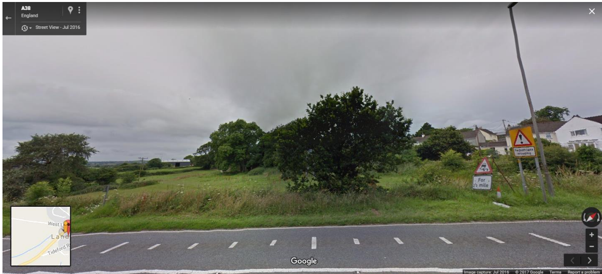
Image 7: From Google Streetview looking directly towards the West Across the site.