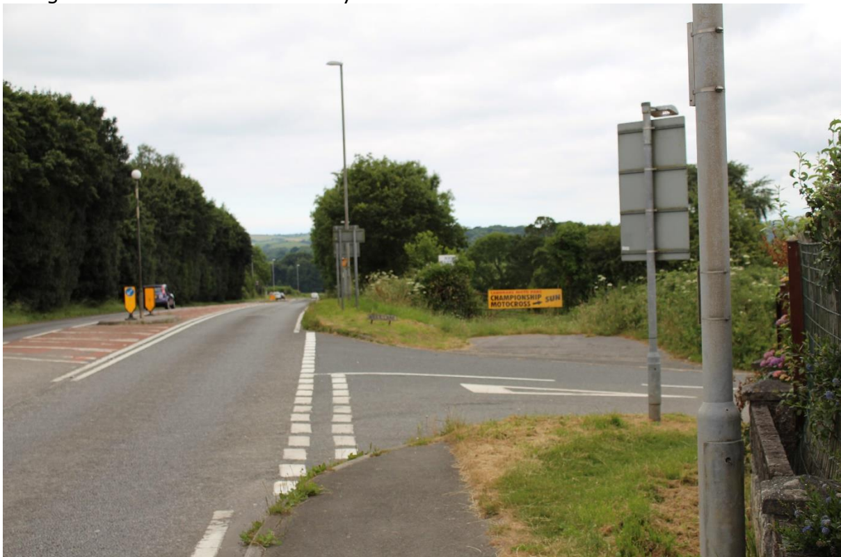
Image 6: Image looking southwards from the footpath adjoining the A38 and across entrance to West Lane. The existing site entrance and location for Images 3 to 5 is where the yellow banner is displayed.