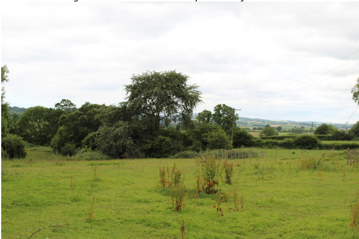
Image 4: Image from the same location as Image 3 but looking towards the south-west across the site, note the tree belt running in the centre of the image which represents to lower boundary of the site.